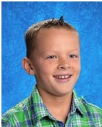
Grade 6-8: for his display of honesty, encouragement and manners in and out of the classroom