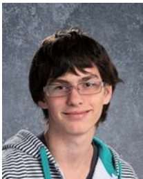
Grade 9-10: for consistently upbeat attitude no matter the task