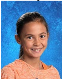
Grade 3-5 for always being a willing, caring helper in the classroom and on the playground