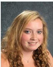
Grade 11-12: for excellent time management skills in balancing school work, extracurricular responsibilities and work