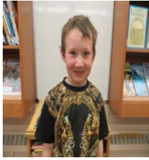
K-2 for his dedication to improving his reading skills