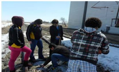
How High is Pangman Elevator ?

By measuring the length of the elevator's shadow and using the measurement of the shadow created by a metre stick as their model, students used right angle trigonometry to extrapolate their findings and get the answer.