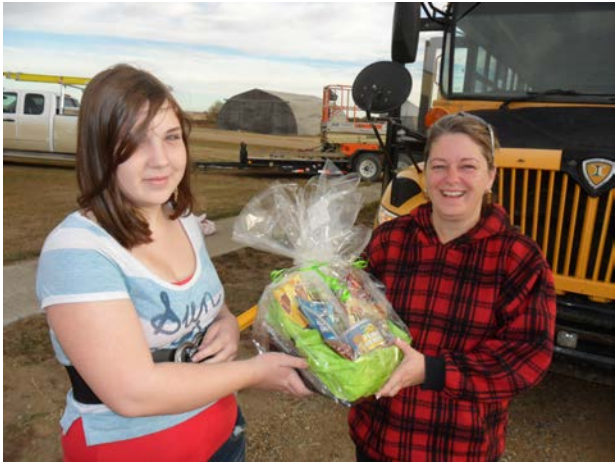
Bus Driver Appreciation Day Oct. 15