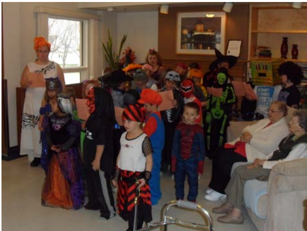
K-2's sang Halloween songs at Care Home

The SRC hosted Halloween activities in the gym on Oct. 31. The Spirit Teams played Halloween themed Pictionary & Charades. Costumes were varied and creative.