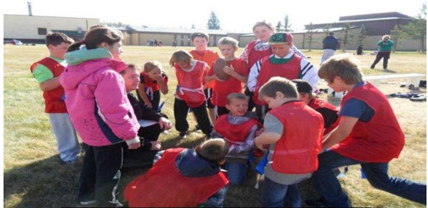
Grades 4-9 Boys & Girls Flag Football Team