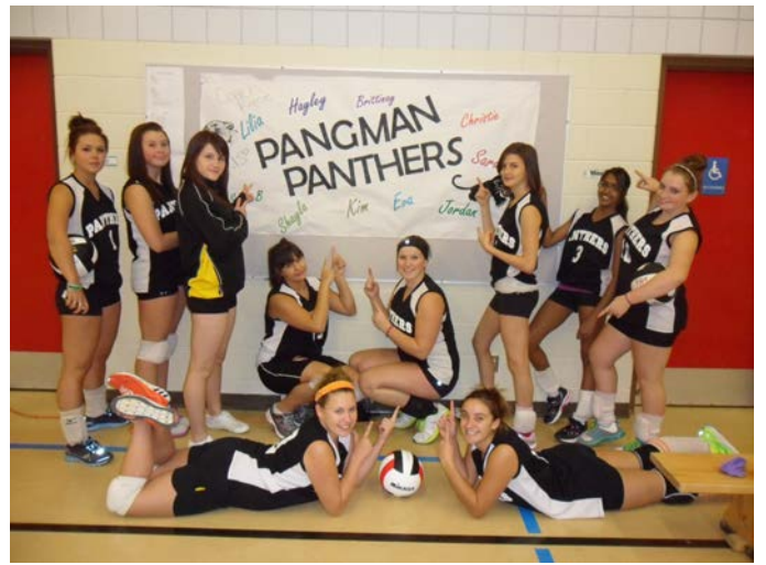
Sr. Girls won Gladmar Volleyball tournament Oct. 27

The SRC hosted Halloween activities in the gym on Oct. 31. The Spirit Teams played Halloween themed Pictionary & Charades. Costumes were varied and creative.