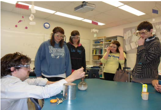
Mr. Callfas's Grade 9 & 10 science class learning about chemical decomposition reaction.