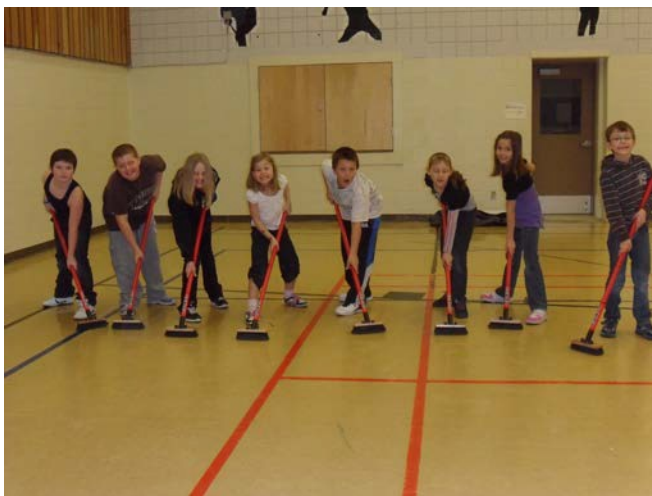
Grade 3-5 learning to "hurry hard"

The Ogema Curling Club had made arrangements to sponsor the "Rocks and Rings" curling program for our students. The instructors came to our school and used the gym to introduce the sport of curling to our students through many different fun physical activities. This was a great opportunity to learn about the game and maybe become involved in this sport.