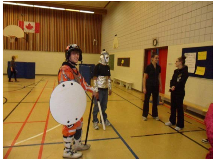
Ready to Battle for King And Country