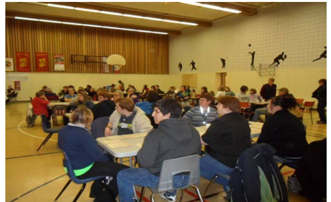
Bingo Night in Pangmam – Proceeds to Telemiracle