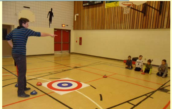
Learning to Curl

Pangman Student Ski Trip Saturday, March 3 Bus Departs School 7:15 AM -Return 7:00 PM