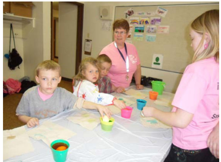
Grades 3-5 Preparing Easter Eggs