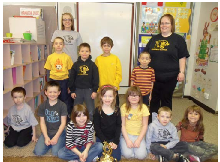
K-2 Winners of Panther Pride Day