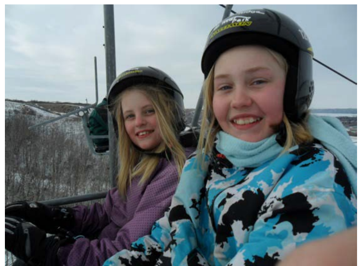
Riding the lift for the next trip down on school ski trip!