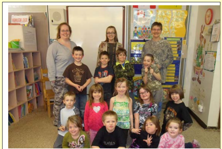
K-2 on Camouflage day