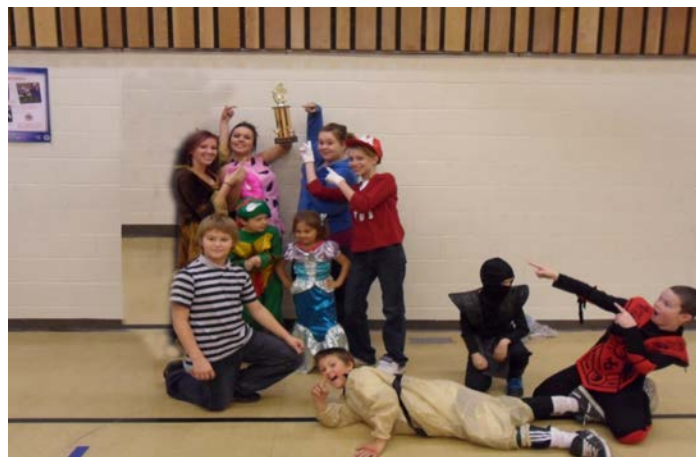
Winners of the Halloween Challenge Award