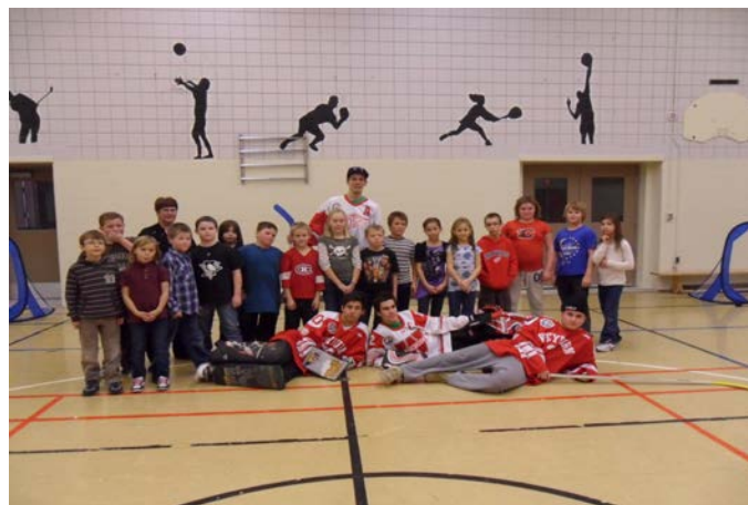
Grade 3-5 in Photo with the Weyburn Red Wings