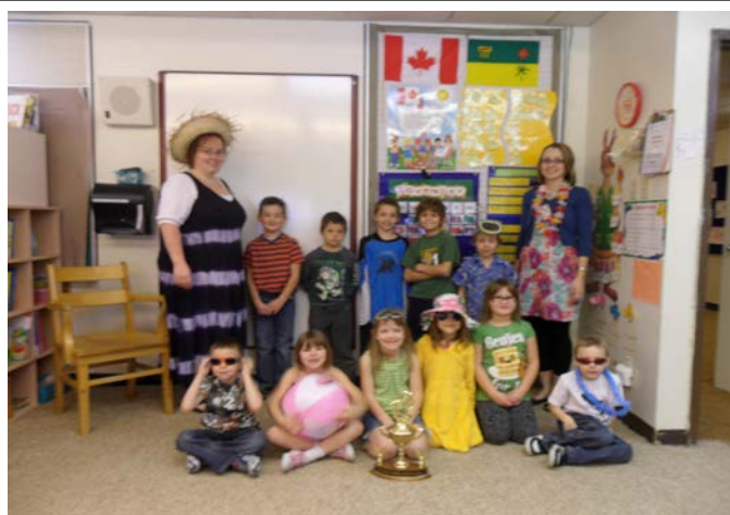
K-1-2 win the Tropical Paradise dress up day